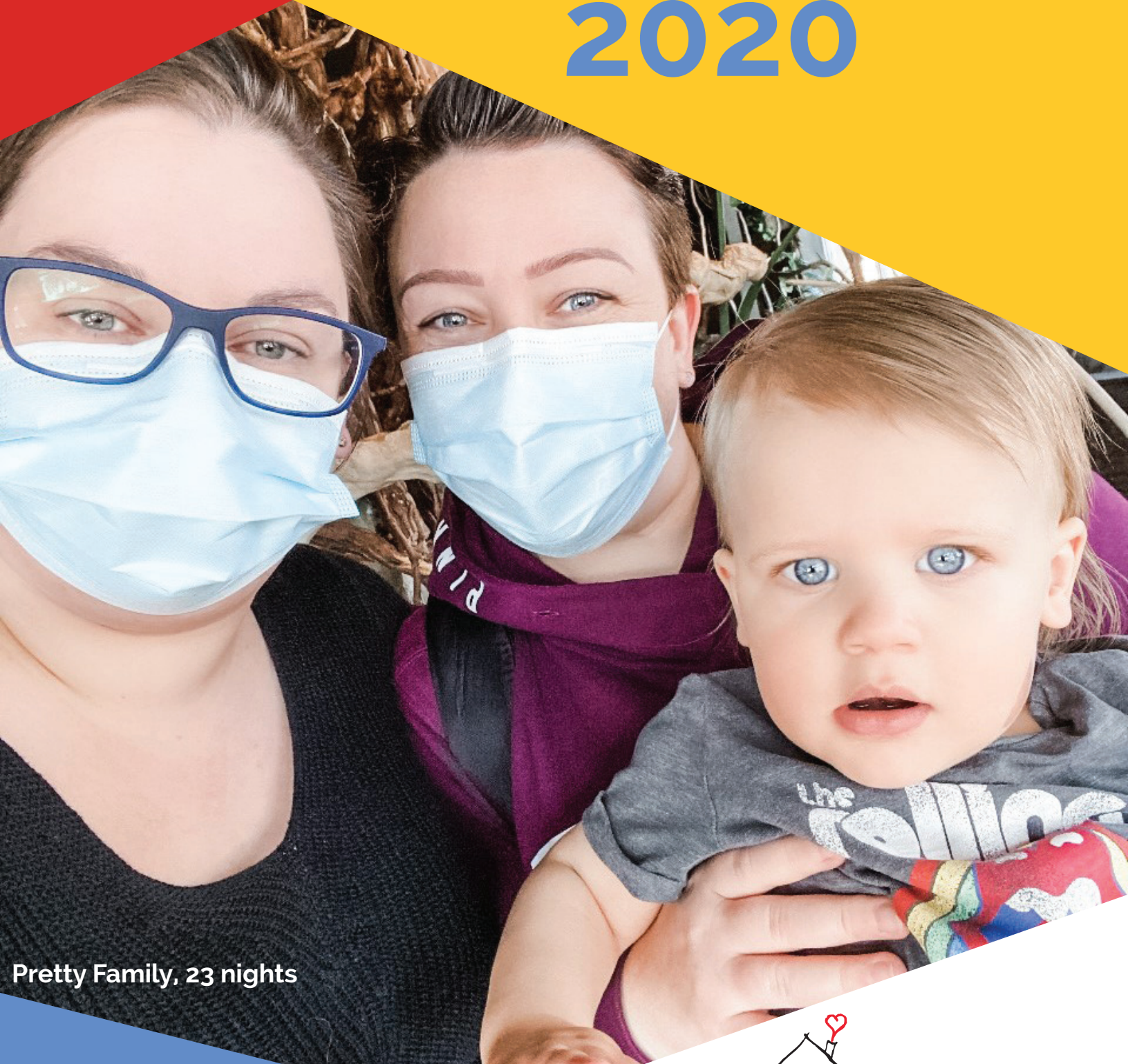
Pretty Family, 23 nights